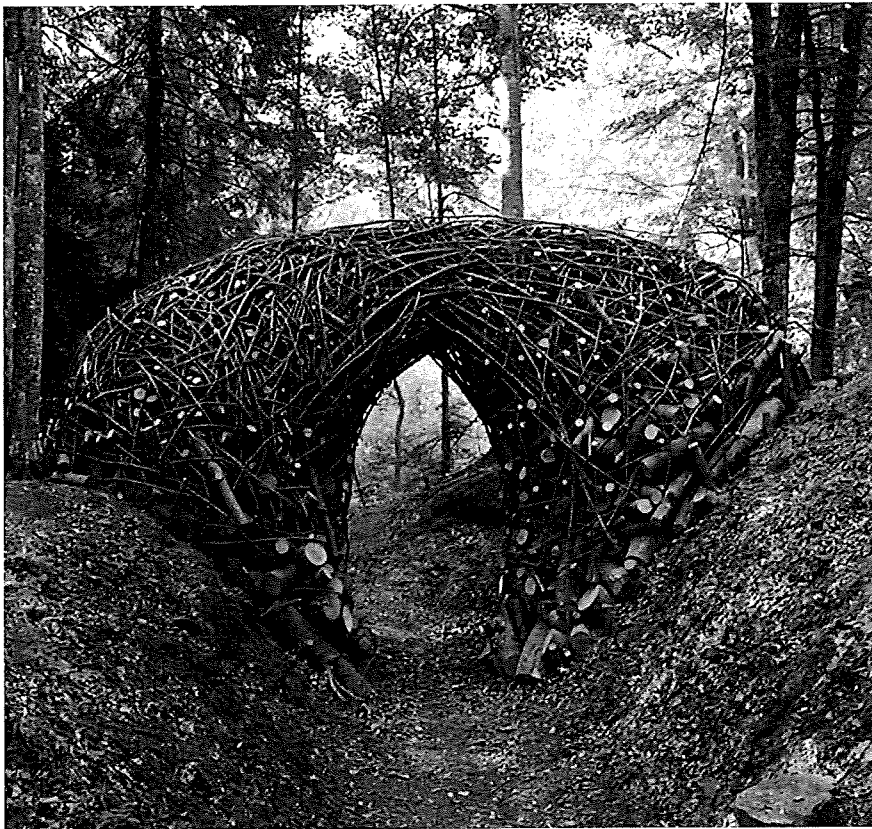
Spruce and ash tree, by Bob Verschueren, Italy

The park could also be a place where environmental art is encouraged: