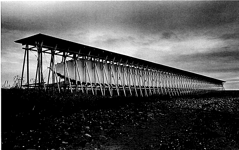
Steilneset Memorial, Norway

We can also see an opportunity for a modern architectural interpretation for a whare, one that may house river going waka, that responds to this river side site in an inventive way.