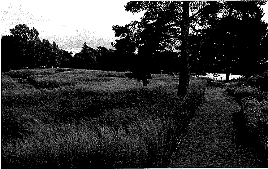
Grasslands by Piet Oudolf,

aspect (see Dutch landscaper, Piet Oudolf's work). There is a risk that a natives-only planting may end up feeling a bit artificial, a bit too cleaned up - keep it real and in balance somehow.