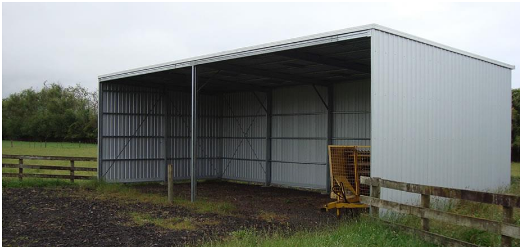
Farm shed option (single bay)