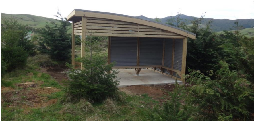
Arapuke Kiwi Curved Shelter option