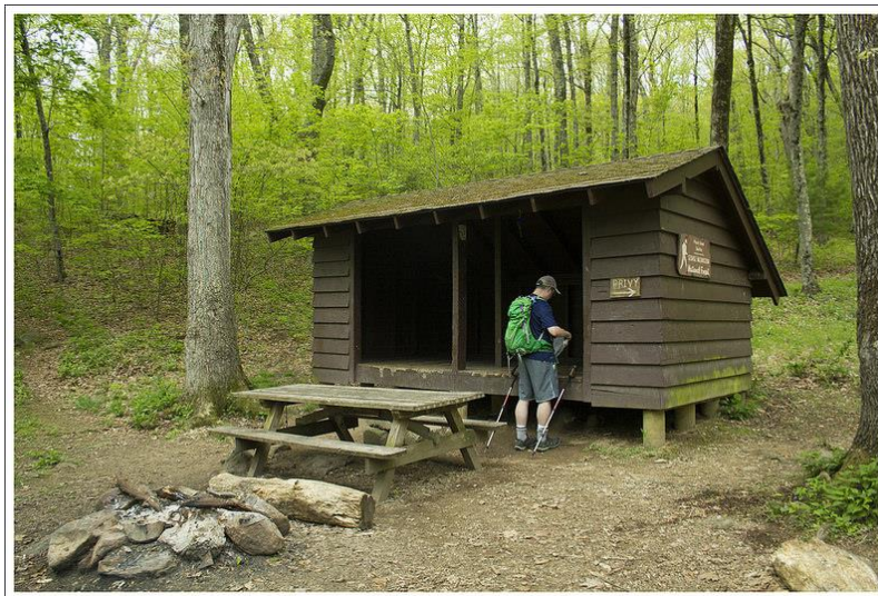
Example of Appalachian Trail shelter, USA