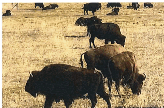
A US national icon, Montana is home to many Bison farms and protected areas where Buffalo roam. This farm is on the outskirts of Missoula City.