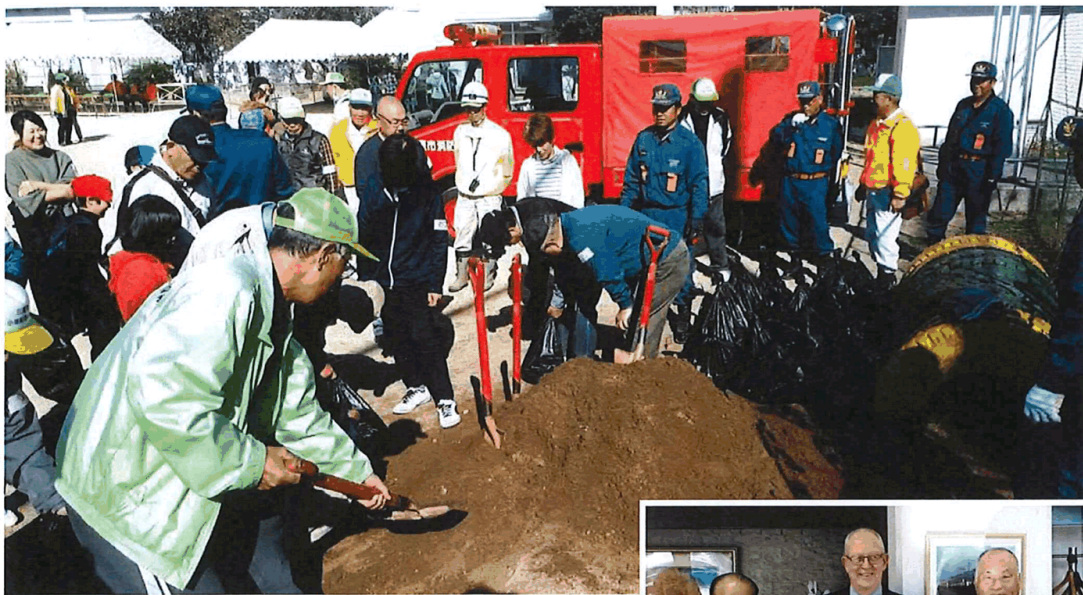
Above: Mihara locals learn how to make sandbags