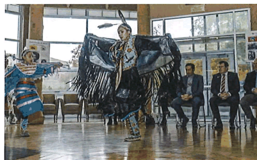
Students at the Payne Native American Studies Department, University of Montana, perform at a welcome for the Palmerston North delegation

happened across the years, this was the first Mayoral-led Palmerston North visit in the 36-year history of the relationship, adding to the significance of the trip.