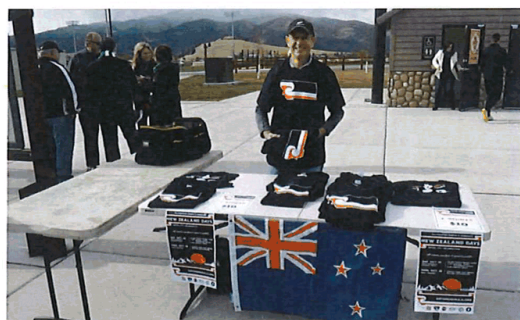
"New Zealand Day" events hosted in Missoula, Montana, celebrating the longstanding Sister City relationship.

The Palmerston North delegation were billeted in Missoula with local families, which added a personal touch to the visit. While many exchanges have