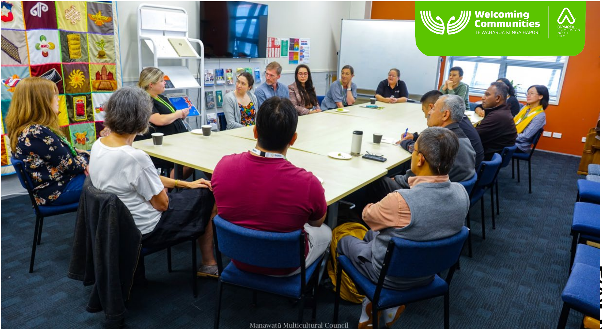
Manawātū Multicultural Council