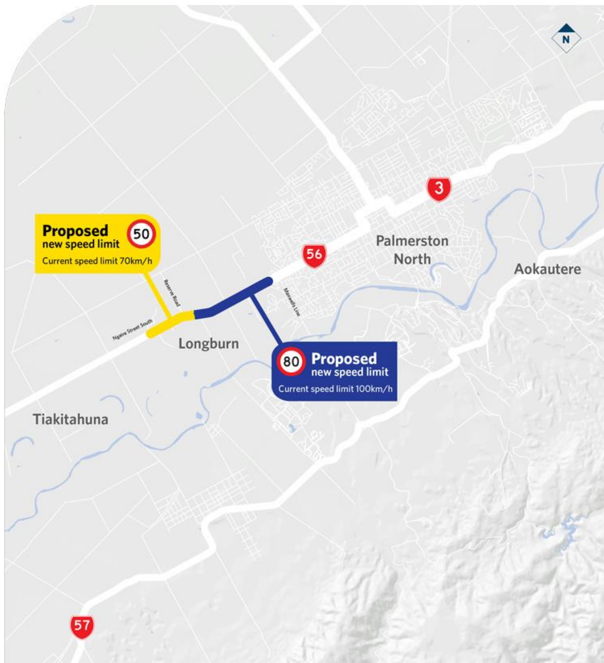
Figure 1: Waka Kotahi SH56 Speed Limit Review Proposal

Officers have recommended supporting the proposed 50km/h speed limit for Longburn village as this is in line with Council's previous feedback to Waka Kotahi on the Ōpiki to Palmerston North Speed Review.